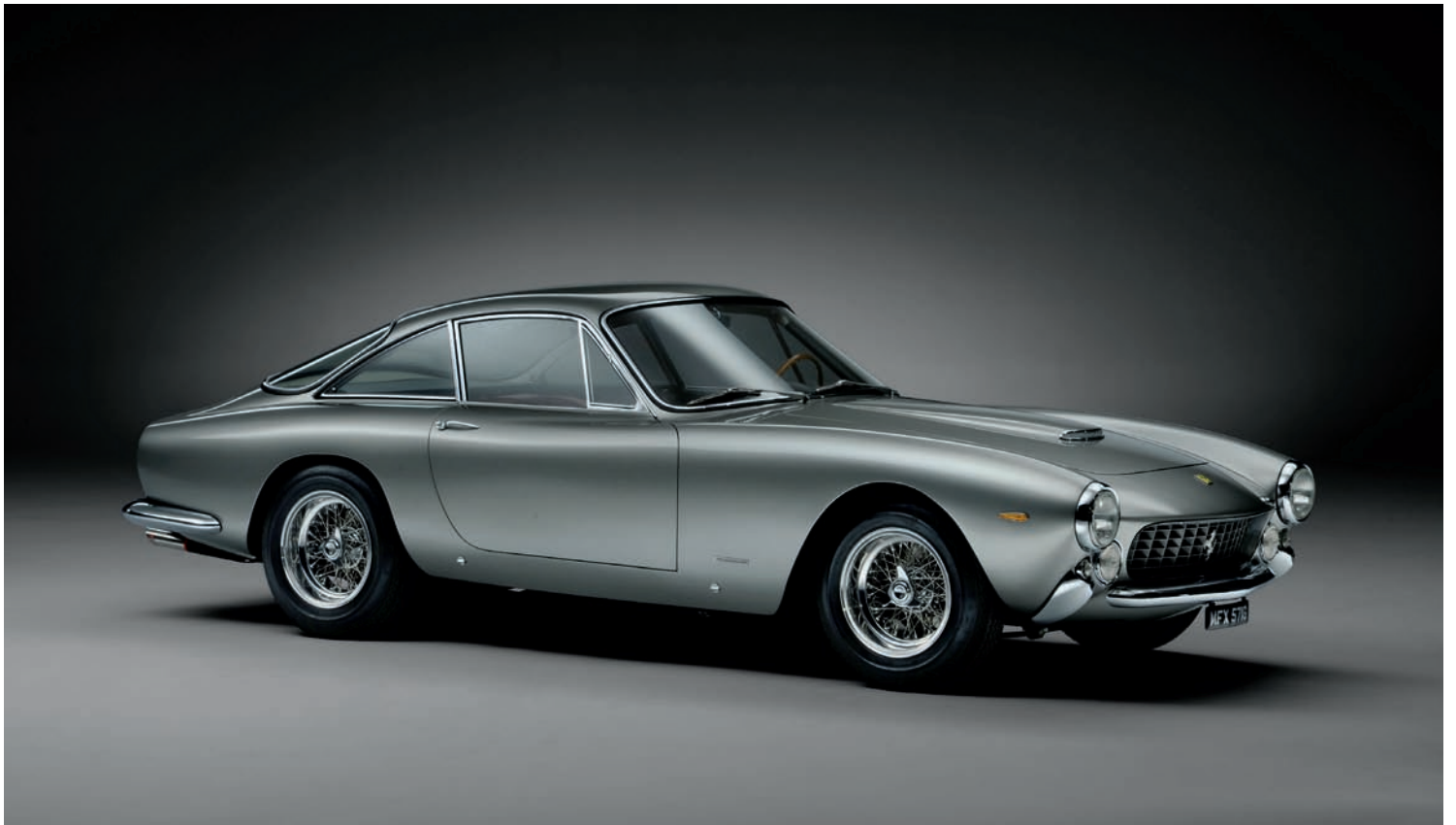
Ferrari 250 GT Lusso. JD Classics Concours Restoration