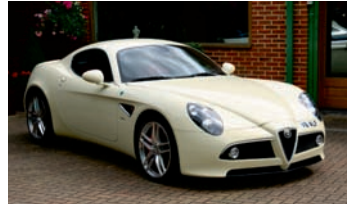
Alfa Romeo 8C Competizione