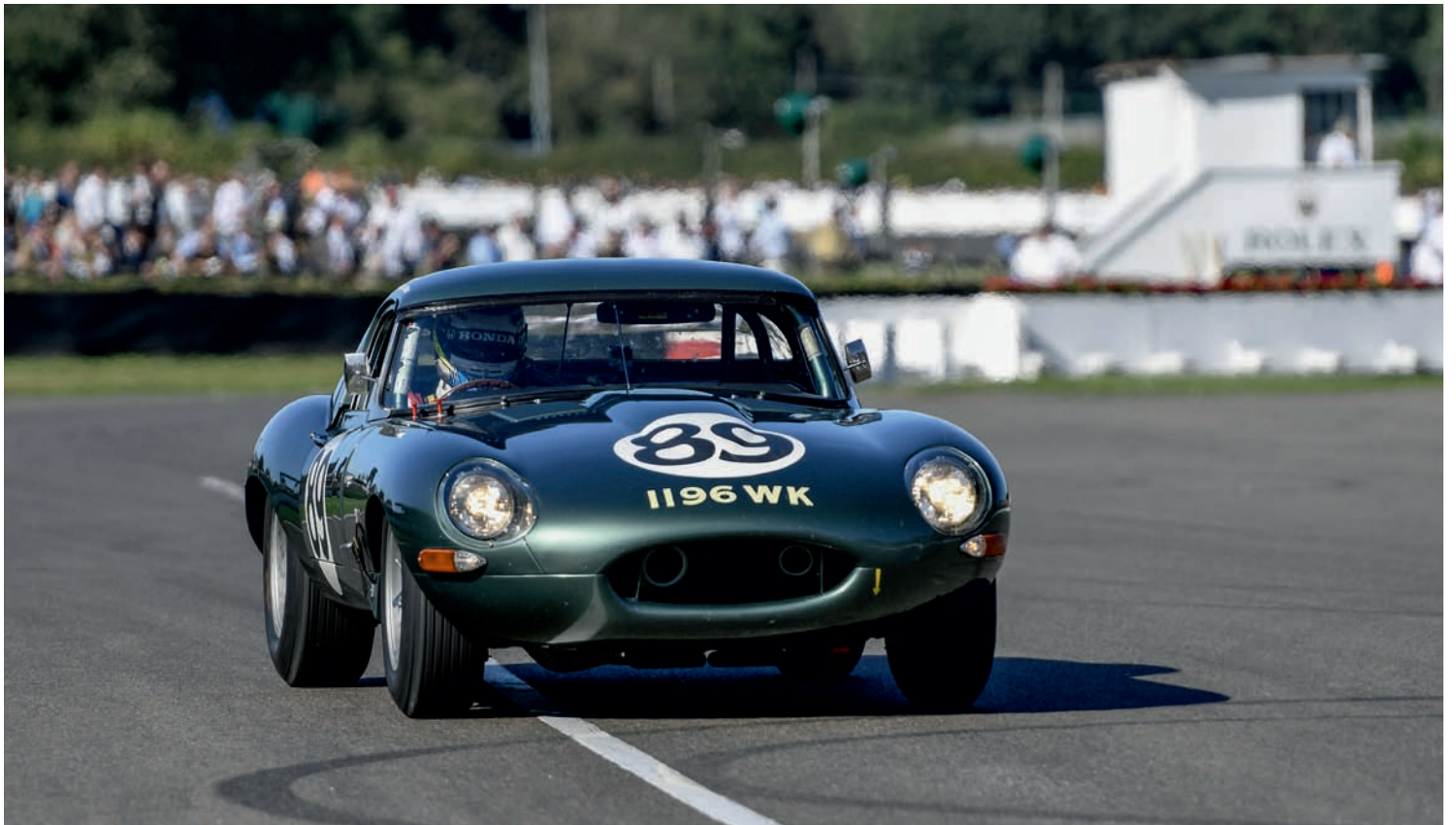
JD Classics' Lightweight E-Type Jaguar