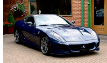
Ferrari 599 GTO