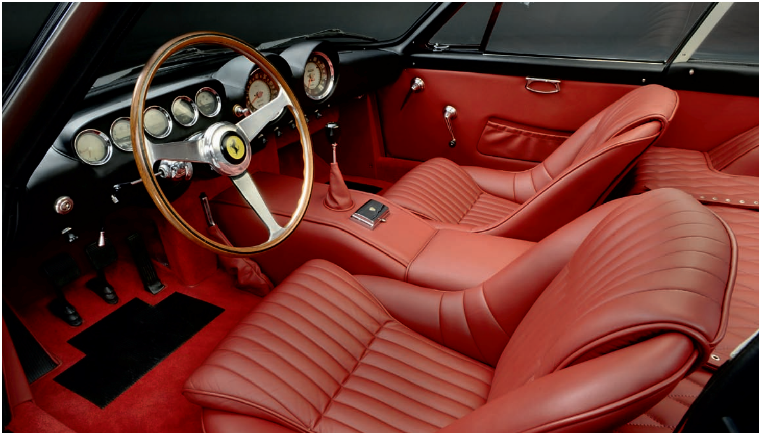
Ferrari 250 GT Lusso