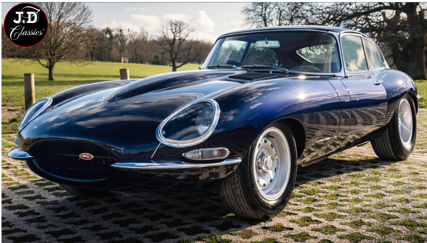
JD Classics WM Sport Jaguar E-Type GT