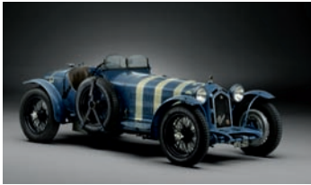
Alfa Romeo 8C Monza