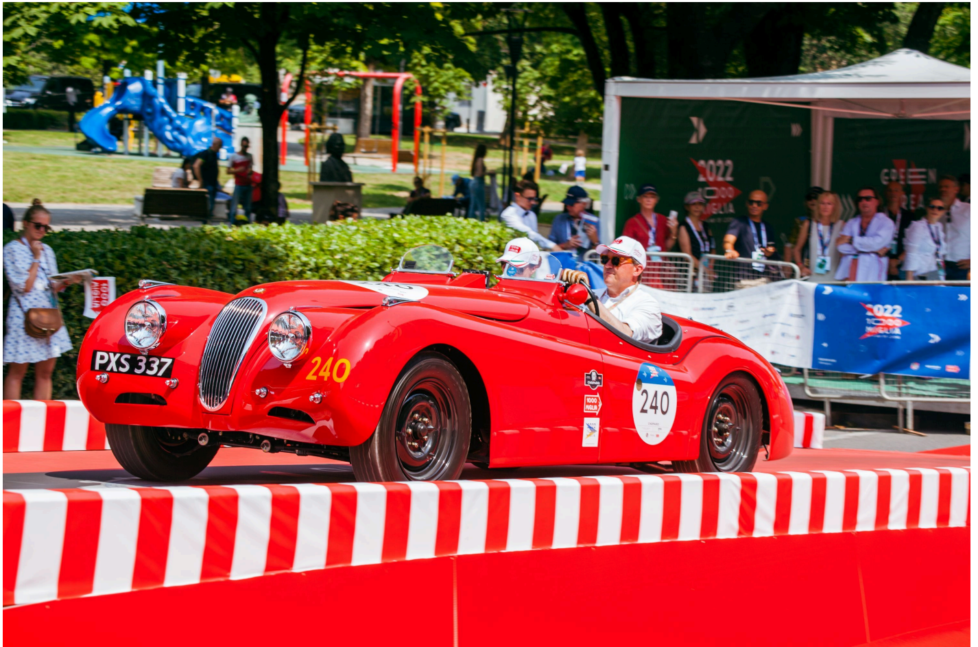
Jaguar XK120 finishing the Mille Miglia 2022