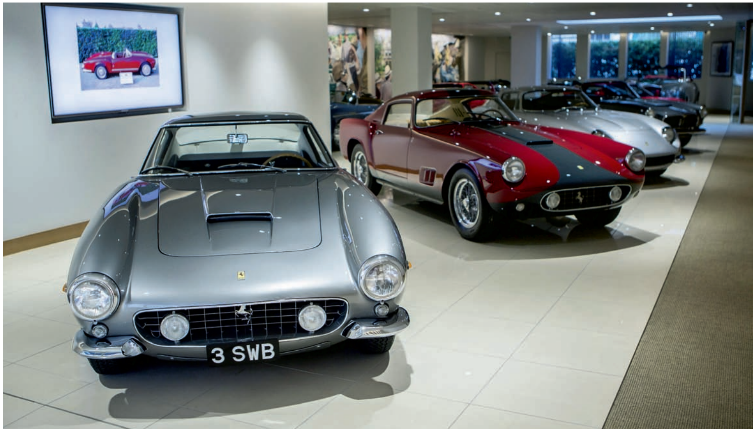
The JD Classics Mayfair Showroom