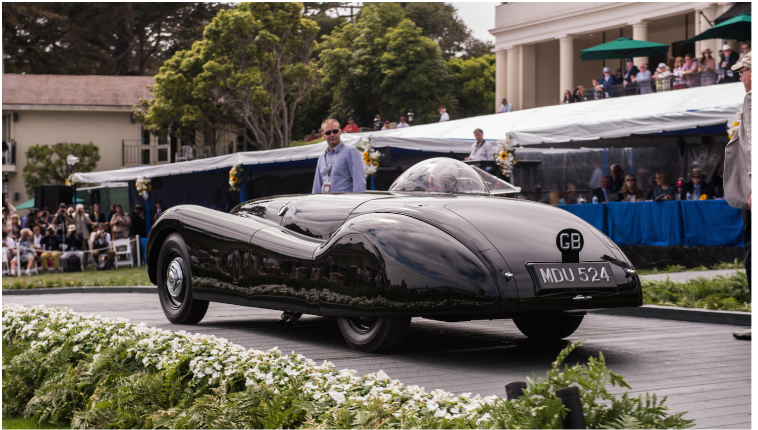
JD Classics restored landspeed record XK120