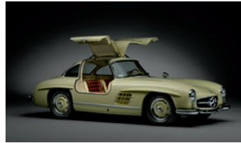
Mercedes 300SL 'Alloy' Gullwing