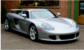
Porsche Carrera GT