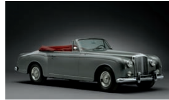
Bentley SI Continental Park Ward