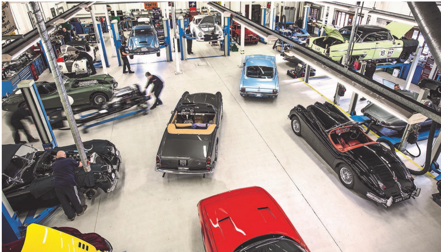
JD Classics' Restoration Workshop