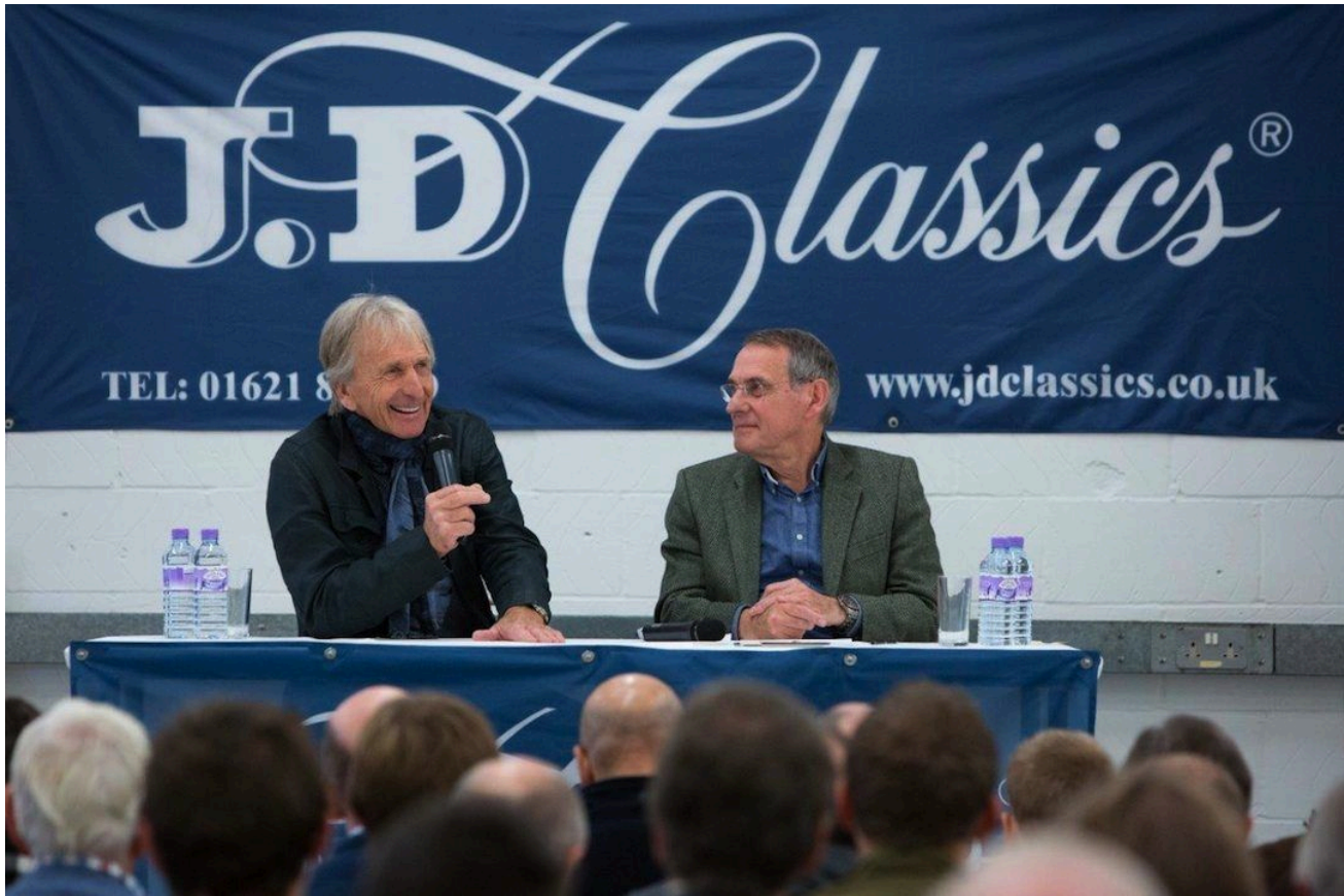
J.D Classics Open Days are Great Networking Opportunities (and fun!)